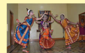
● Performance in Temple Silver Jubilee-2015