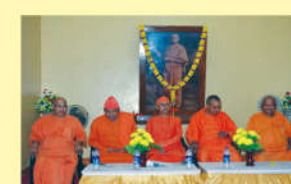
● Temple Silver Jubilee - 2015