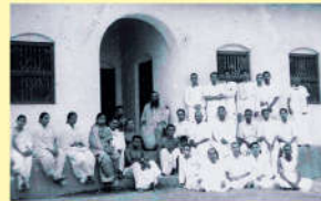
● Swami Virajanandaji - 1946