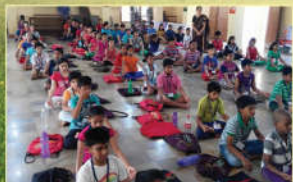
● Summer Camp