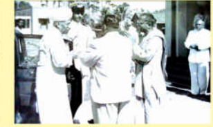
● Dr. S. Radhakrishnan at School - 1961