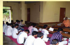
● Personality Development Class