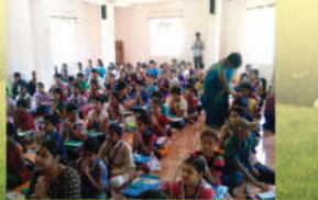
● Value Education Class