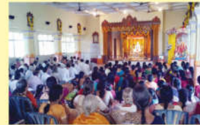
● Devotees at Temple

2. Ramakrishna Mission High School : A Government recognized English Medium Co-ed school from LKG to Xth standard with strength of about 900. The school has its spacious campus in Maharani-peta near Collectorate. The school, functioning since 1958, caters for the economically disadvantaged section of the society.