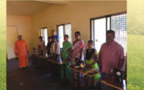
● Tailoring Training