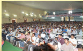
● National Youth Day 2016 - Audience