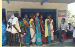
● Mobile Medical Service

The 150 th Birth Anniversary of Swami Vivekananda was celebrated with wide ranging programmes from 2011 to 2014.