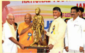
● A P Chief Minister on Youth Day 2016