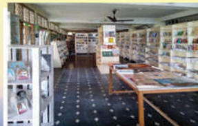
● Book Stall