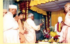
● Inauguration of Temple - 1991