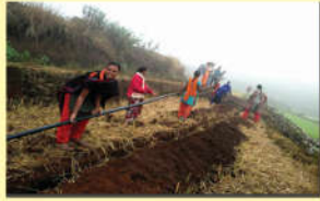
● Water Supply Project