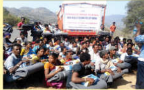
● Solar Light and Blanket Distribution

12. Relief and Rehabilitation : Besides these regular activities, the centre undertakes extensive Relief Works such as Flood relief, Fire relief, Cyclone relief, Distress relief etc. in times of need. In the wake of severe Cyclone HUDHUD that hit Vizag in Oct 2014, the Mission conducted extensive relief by way of providing drinking water in various localities of the city with three tankers, distribution of food articles to 3500 families, and distribution of Solar Lamps with cell charging facilities to 8300 families in rural areas. Ashrama also constructed a non formal education centre in a distant Walabu village. Anganwadi programmes are held daily and free tailoring training for women are being conducted apart from the regular mobile medical services in the above centre. A project to supply waters from the natural springs, located at long distances, up to the villages with HDP pipes was also implemented. The amount spent in these operations was Rs. 140 Lakhs.