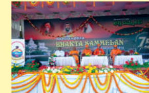
● Ashrama Platinum Jubilee - 2014