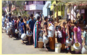
● Water Relief