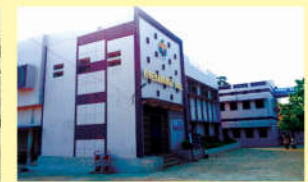
● School Buildings

7. Exhibition : An exquisite Doll Exhibition depicting the lives and teachings of Sri Ramakrishna, Holy Mother Sri Sarada Devi and Swami Vivekananda is an added attraction in the Ashrama. Entry to the exhibition is free.