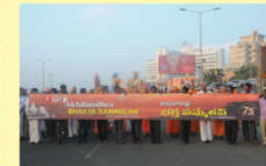
● Platinum Jubilee - Procession