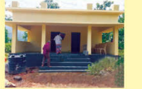
● Non Formal Education Centre at Walabu