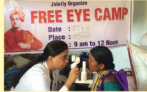
● Free Eye Camp