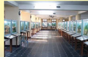
● Clay Model Exhibition