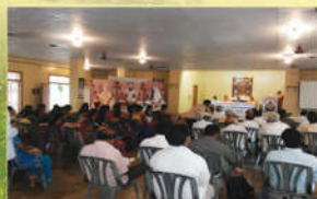
● Teachers' Workshop