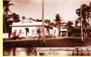
● Ashrama - 1941