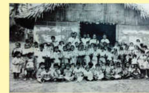
● School - 1958