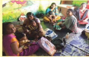
● Children at Cerebral Palsy Clinic