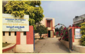
● Cerebral Palsy Clinic