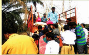
● Food Distribution